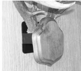
Figure 4 Side View

Note: If the base of each antler is not symmetrical you might have to file one side a little so that the antlers will set even.