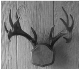
Figure 3 Front View